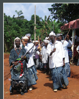
Ekpe members wearing ukara cloth wrapper at a burial ceremony. Nturi Village, Akwalbom State, 2005.