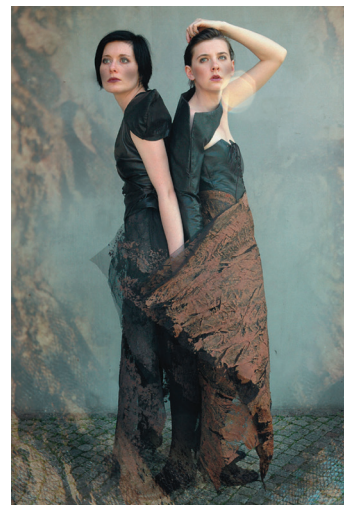
Monika Izabela Kostrzewa, fashion art and graphics from the collection entitled Fibrils in Leather Setting , 2011. Image of Visible/Invisible. Print of the XXI Century . Jan Fejkiel Gallery Collection Exhibition, Turchin Center, November 2, 2012 - February 9, 2013.