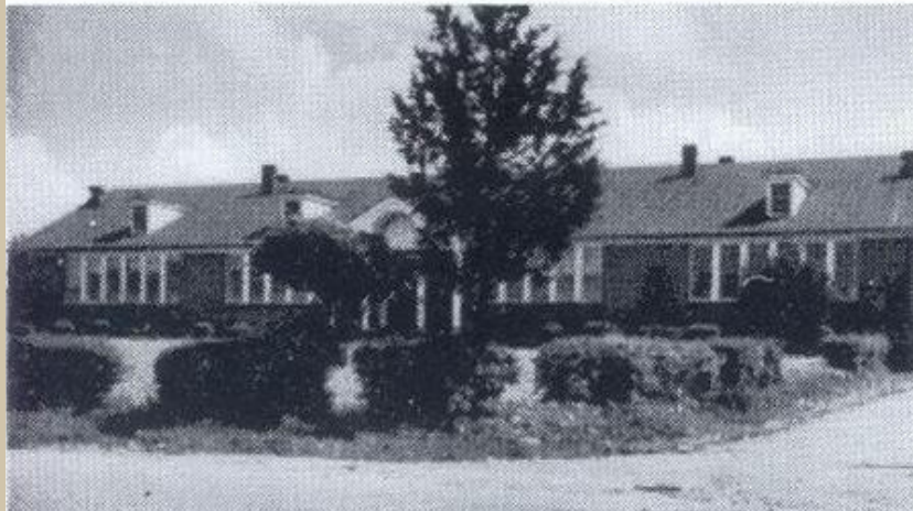
Halifax Training School, 1920-1956 Mary M. Bethune High School, 1956-1969

The Banister Baptist Association built a private African-American training school in 1827, originally consisting of four wooden buildings and a dormitory. The school year was six months, and the grades went only as far as the ninth. Because of transportation difficulties in a county as large as Halifax, the school was primarily a boarding school. Board was $200 a year, which was prohibitive for most blacks at the time.