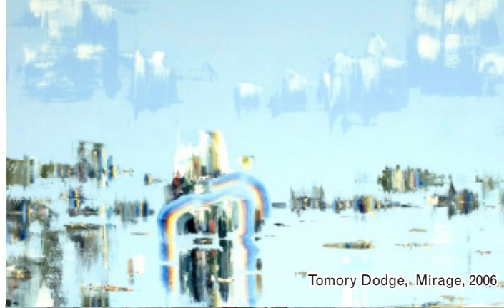
Tomory Dodge, Mirage, 2006