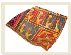
EXHIBIT: UN-WRITING WORLD HISTORY 11/21, 11/22, 11/23, 11/26, 12/03; additional dates thru 02/29

Email | Phone | Web | https://facebook.com/events/173502032847422