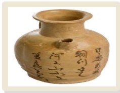
EXHIBIT: STONEWARE ON THE SILK ROAD

Email | alex.brown@ncdcr.gov Phone | (336) 725-1904 Web | http://www.secca.org