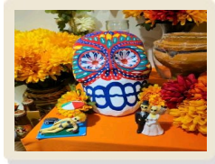
EXHIBIT: LIFE AFTER DEATH: THE DAY OF THE DEAD IN MEXICO

10/28, 10/29, 10/30, 11/02, 11/03; additional dates thru 12/10